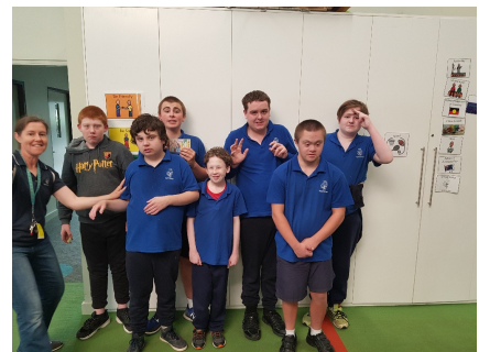
All of Room 8 for handling lockdown without a fuss.