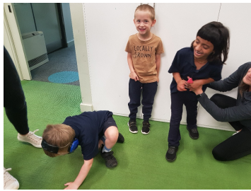
All of room 1 for adjusting well.