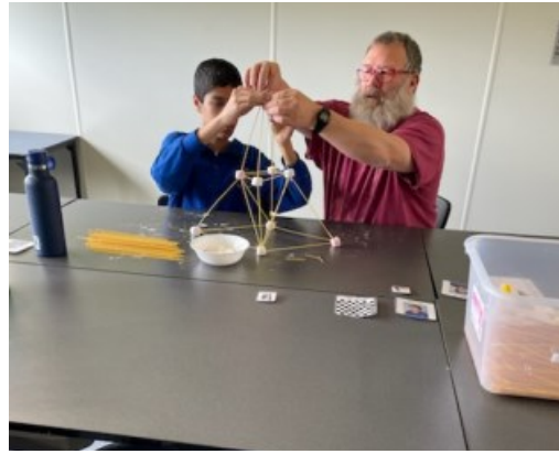
Room 8 students enjoyed making towers out of spaghetti and marshmallows in Technology looking at structures and landforms.